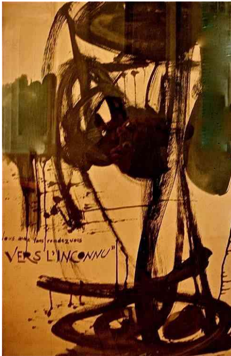
Figure 5: Anonymous, Vers l'Inconnu , 1957, Exhibition Poster.