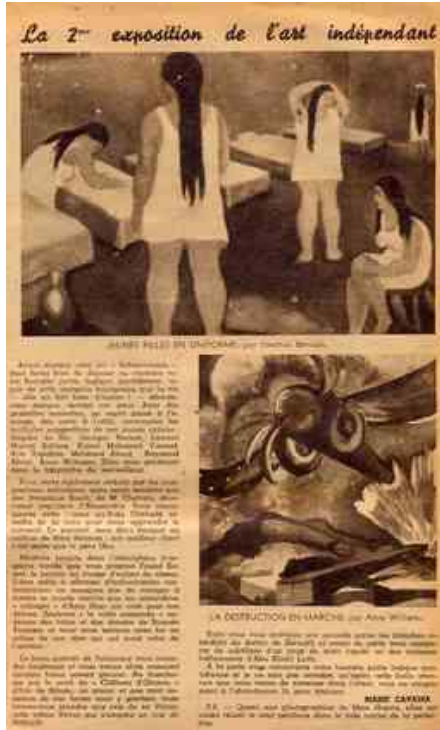
Figure 2: La 2 e Exposition de l'Art Indépendant (detail), exhibition review by Marie Cavadia.