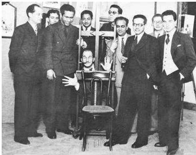
Figure 3: Anonymous, The Art and Liberty Group , 1941.