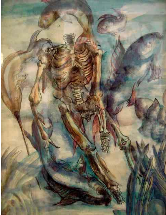
Figure 4: Amy Nimr, Untitled , 1936, watercolor on paper.

This painting was on show at the second Art and Liberty Group exhibition.