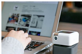
Softbank readies pint-size smart speaker Nikkei Asian Review

Sponsored content by Outbrain ( http://www.outbrain.com/what-is/default/en )