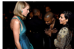
Property Wars: Kim Kardashian West and Kanye West Vs. Taylor Swift Mansion Global