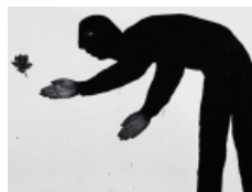
Arab artists: Sadik al-Fraji paints black silhouettes...