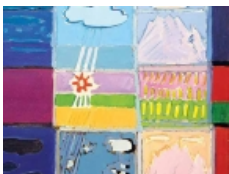
Arab artists: Basha finds mysteries in painting...