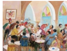
Arab artists: Jouni captures the faces of people...