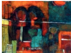
Arab artists: Mohammed Farea's mud house inspiration...