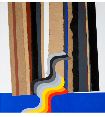
Mohamed Melehi, Untitled, 2012, Mixed media on canvas, 120 x 115 cm. (Courtesy of Loft Art Gallery)

Melehi's radical geometric experiments and his iconic wave motif were pivotal in shaping the aesthetic of post-independence Morocco.