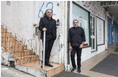
ArtReview Opinion artreview.com

Khaled Sabsabi exhibition cancelled following Venice Biennale sacking