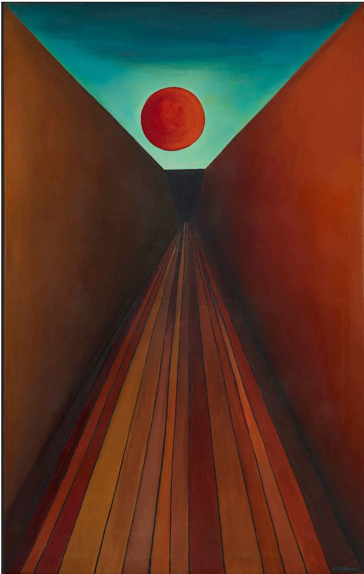
Samia Osseiran Junblatt, Sunset , 1968, oil on canvas, 110 x 69 cm.

Hamdan Ballal, Oscar-winning Palestinian filmmaker, attacked [updated]