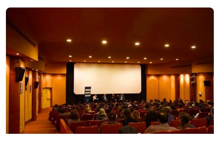
Metropolis Cinema To Open New Theaters In Mar Mikhael This Summer