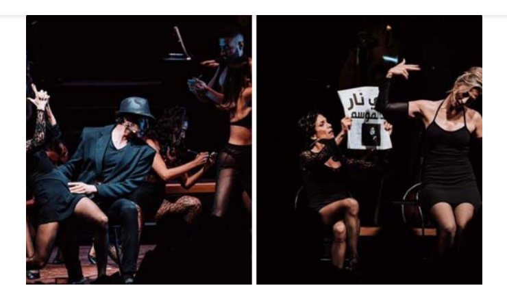
Broadway Play 'Chicago' In Arabic Is Coming Back To Lebanon