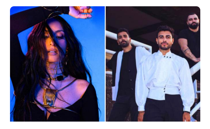
14 Lebanese Musicians You Should Watch In 2024