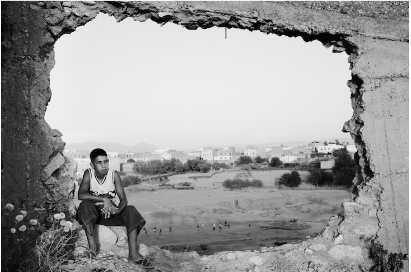
From the series No Pasara (2008), Leila Alaoui. Courtesy Fondation Leila Alaoui/Galleria Continua