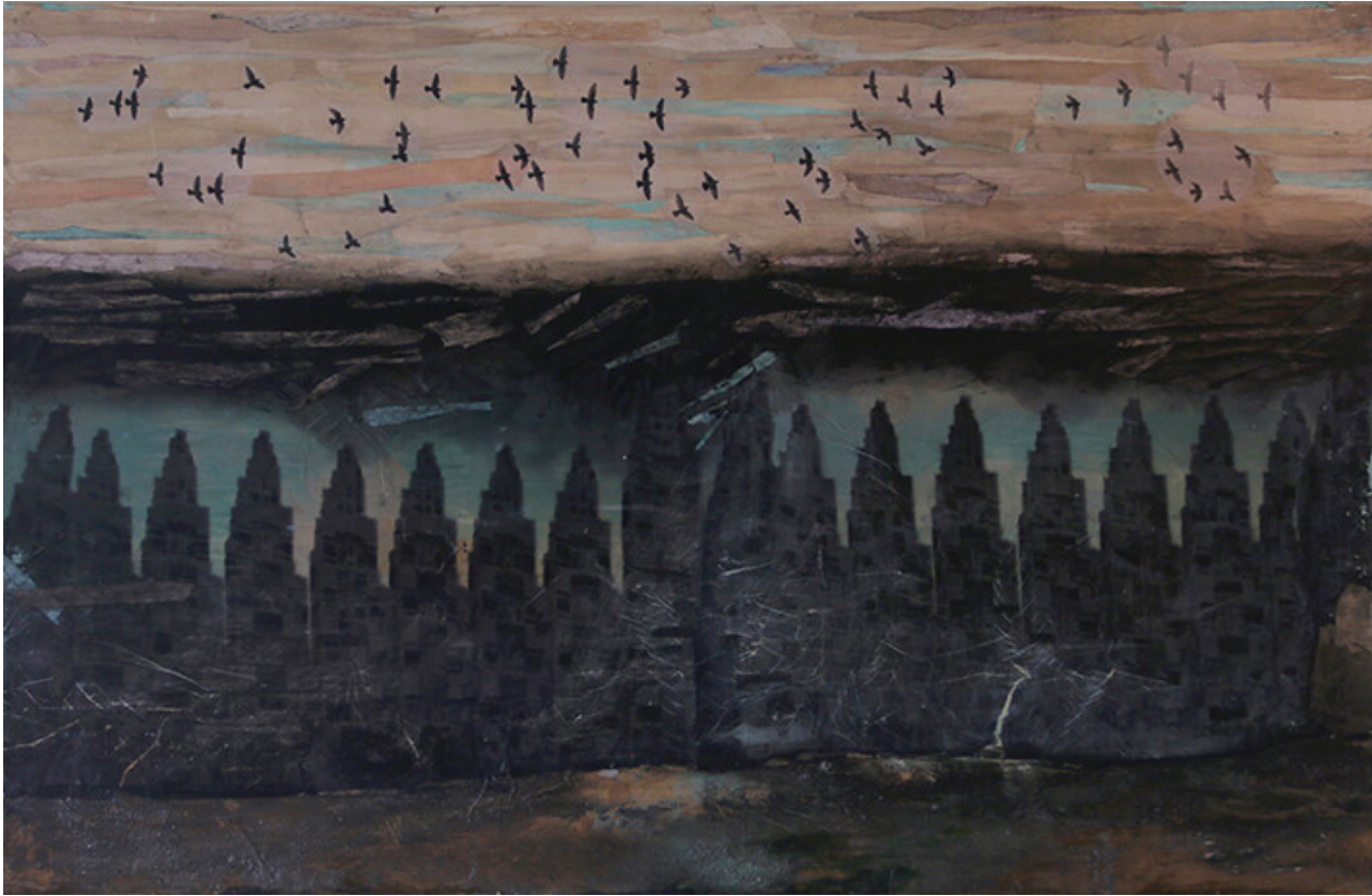
Inass Yassin, "Transformation #2," mixed media on canvas, 200x130cm, 2008

Khalil Rabah's "Art Exhibition" most cleverly encapsulates the mission of Unlike Other Springs : a single image made up of some 50 photographs of Palestinian art exhibits from as early as 1954, presented in locations that span the globe.