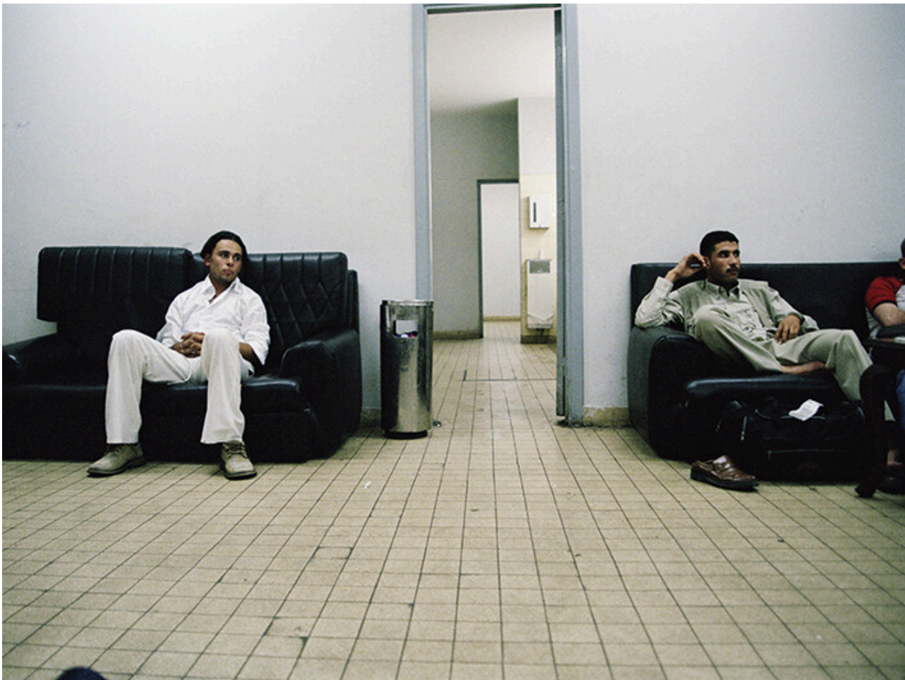
Taysir Batniji, still image from video “Transit,” 2004 (Courtesy of the artist)

The museum has encouraged new works by young artists, such as Amer Shomali’s “The Icon” silkscreen, produced after the Framed/Unframed ( https://electronicintifada.net/content/leila-khaled-lipstick-women-focused-art-show-tours-west-bank/11717 ) show for which the artwork was conceived and commissioned. The original work, constructed out of 3,500 tubes of lipstick that conjure the image of resistance icon Leila Khaled ( https://electronicintifada.net/tags/leila-khaled ), is now part of a private collection and is one of the best-known works by Shomali.