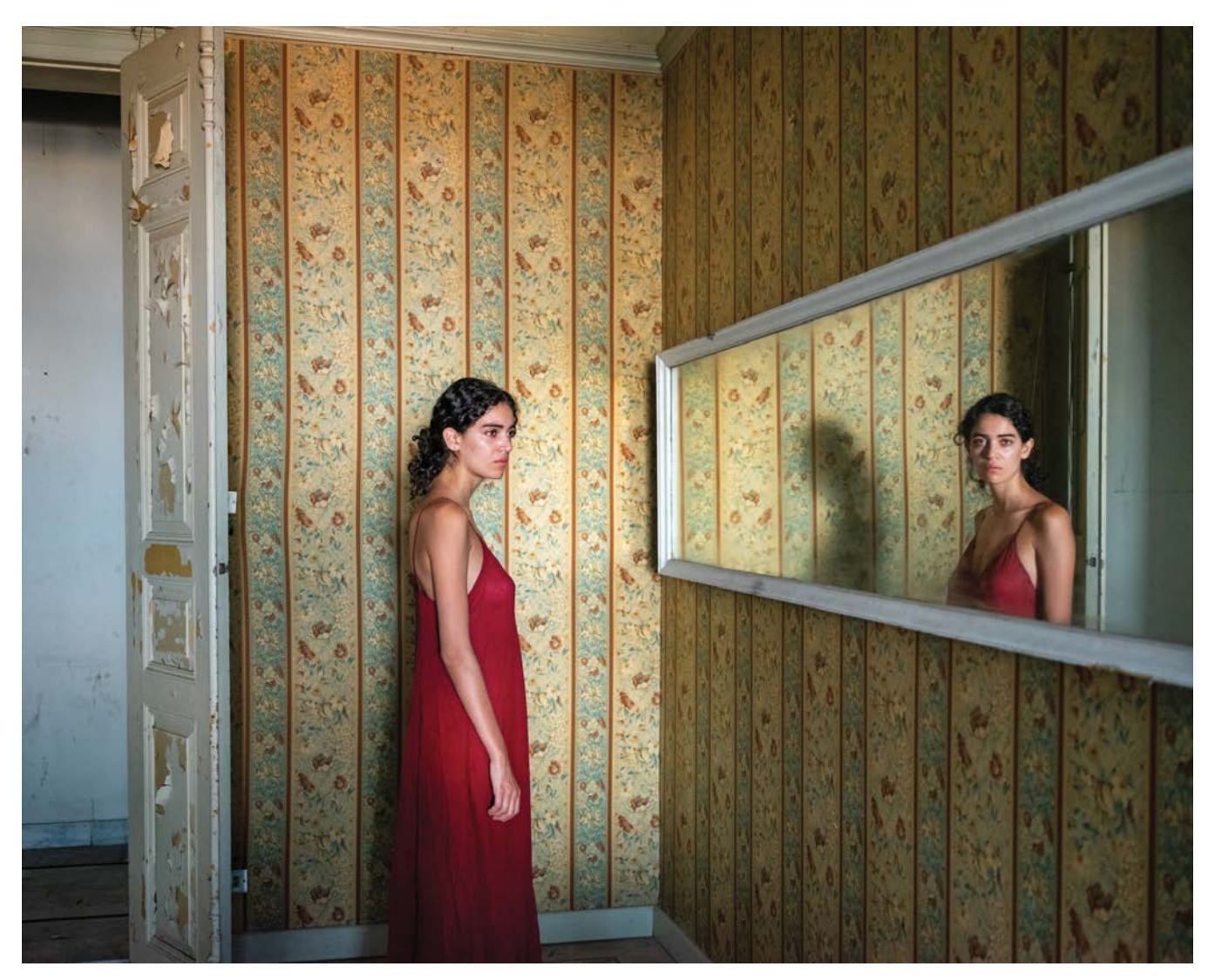
Rhea (In the Mirror), Beirut, Lebanon, 2021

In my work and in my life in general, I am always looking to focus on what unites us rather than divides us, on our essence, our physicality, our vulnerability, on growing up and growing old — the commonalities that make us human, to emphasize underlying similarities rather than apparent differences across cultures \otimes and to ultimately find beauty in our shared humanity.