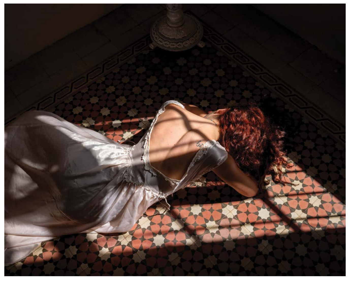
strength), Beirut, Lebanon, 2021) قوة

I am grateful for all the women who came before that have paved the way for us, women today, to be able to break new glass ceilings in the art world. One baby step at a time.